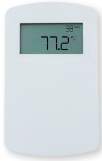
North American style