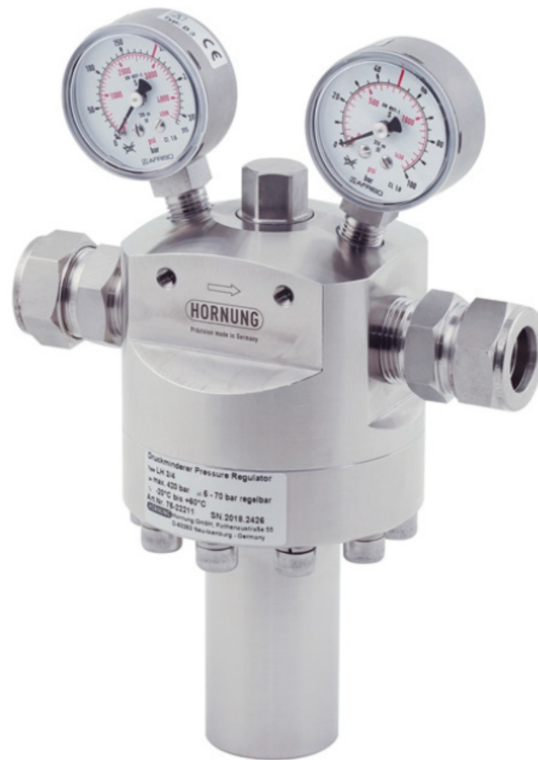
Fittings and gauges optional