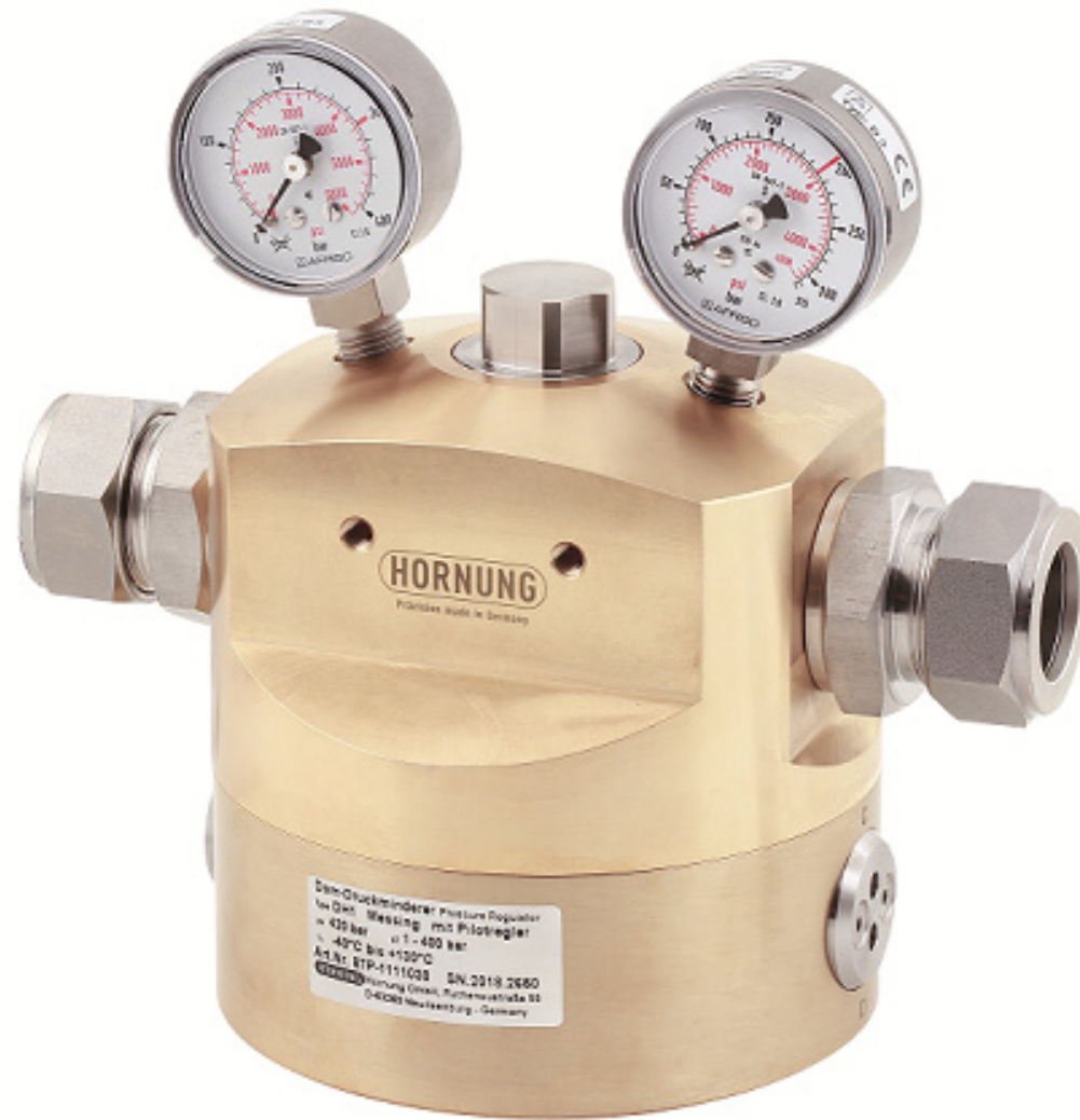
Fittings and gauges optional