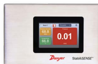
RSMC with stainless steel bezel option