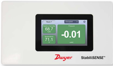
RSMC with standard plastic bezel